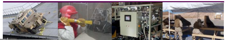
Technology Transfer—Supporting DoD Readiness, Sustainability, and Transformation