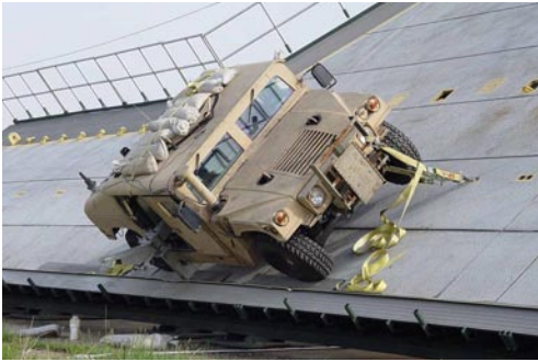
Tactical vehicle rollovers are a key concern. The NDCEE evaluated audio and visual alert devices for HMMWV; one device was tested at the Aberdeen Test Center where drivers found that it allowed them to avoid rollovers.