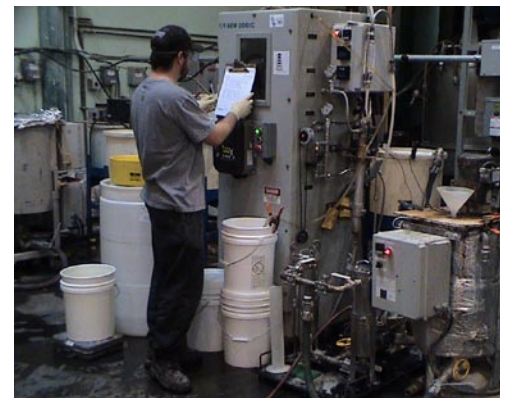
Vibratory filtration was also tested on a pilot scale.