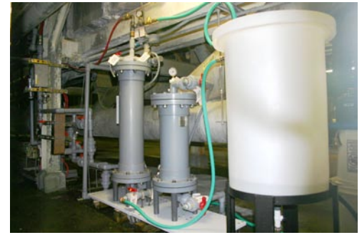
A backwash filter system was designed and constructed for a pilot-scale test.