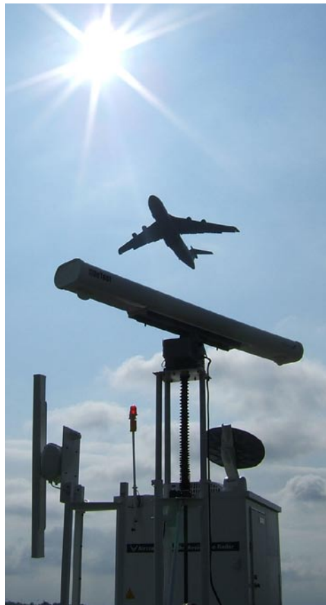
The NDCEE is demonstrating and evaluating Aircraft Bird Strike Avoidance Radar at Dover AFB.

Understanding bird movement patterns and how birds use the land around the