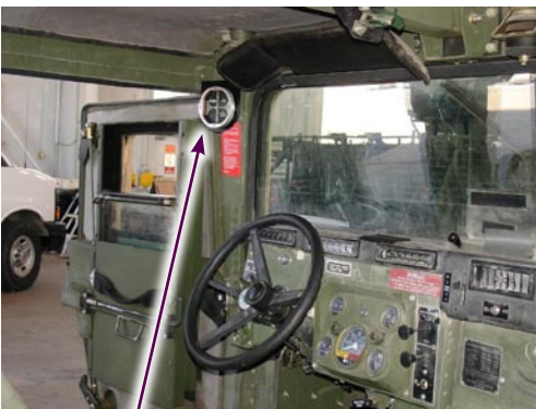
The rollover alert device was installed in the top left corner of the HMMWV cab where a driver could refer to it.